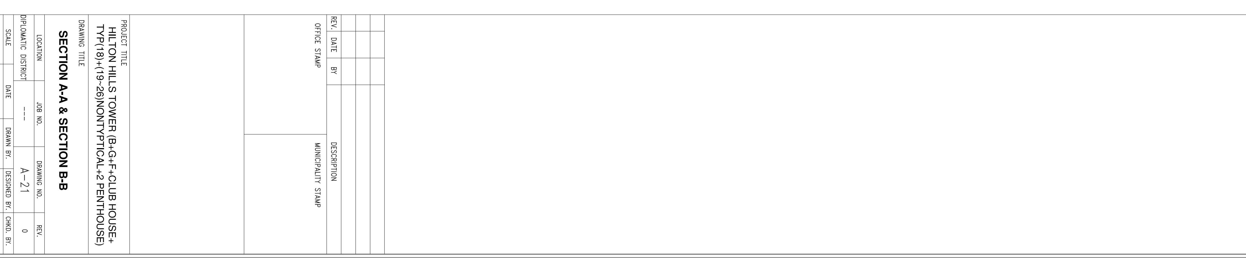
SECTION B-B SCALE 1-150

ABBREVIATION: A.S.L. : ASSUMED ROAD LEVEL F.F.L. : FINISHED FLOOR LEVEL S.W.L. : SOLE WALK LEVEL F.F.L. : FINISHED FLOOR LEVEL S.S.L. : STRUCTURAL SLAB LEVEL T.O.P. : TOP OF FINISHER M.A.L. : MAXIMUM RISE T.O.B. : TOP OF ROOF